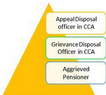
Fig-2 Appeal Disposal at Higher Level

This additional level of oversight will enhance accountability and instill greater confidence in the grievance redressal mechanism. Disposal of appeals at higher level would inspire more sincerity in the initial disposals as well.